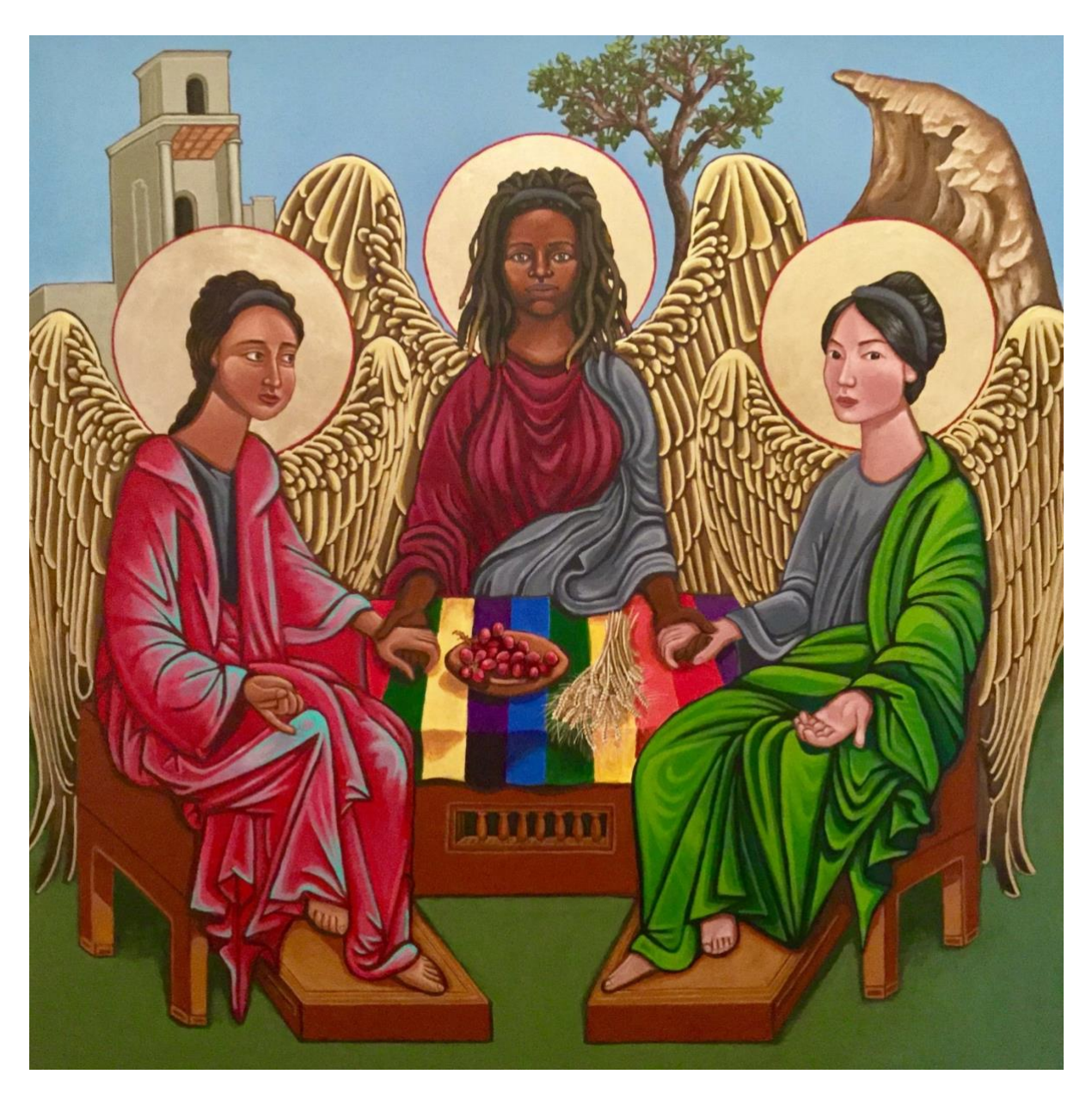
Kelly Latimore's Icon of the Trinity (Trinity) 2016